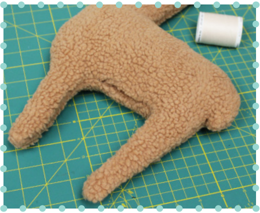
Step 5: Hand sew the stomach closed.