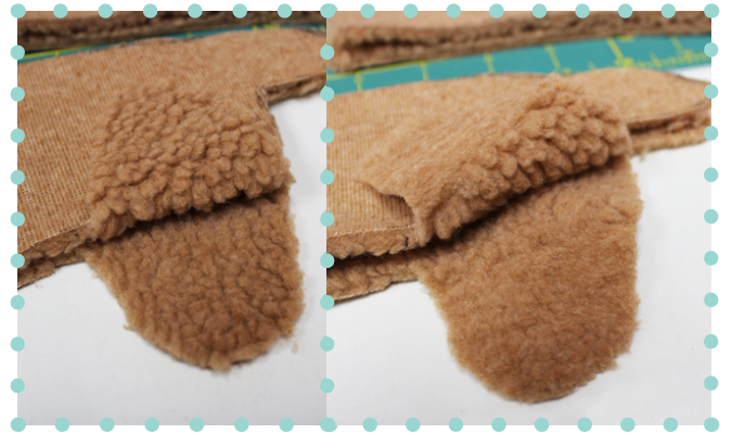
Step 2: Using scissors, cut away some of the 'fluff' from the surface of the fabric. This will make the nose of the Llama more defined.