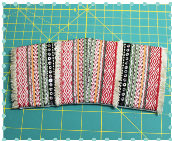
Step 10: Turn inside out and flatten. *Do Not Iron*