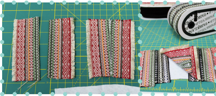
Step 8: Cut small strips of your chosen trims and lay them out as you'd like on the saddle. *Optional: Sew two trim strips together on a slight angle, this will help line up with the angle of the pattern.