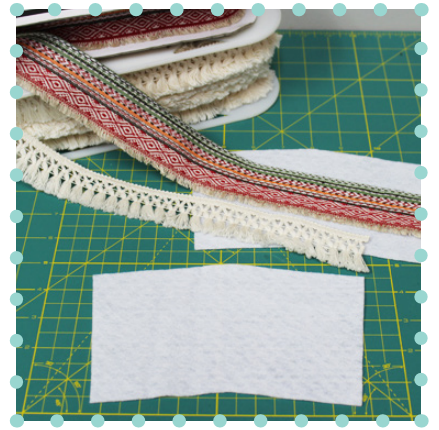
Step 7: Cut out Saddle patterns from White Lightweight Felt, and pick your favorite trims.