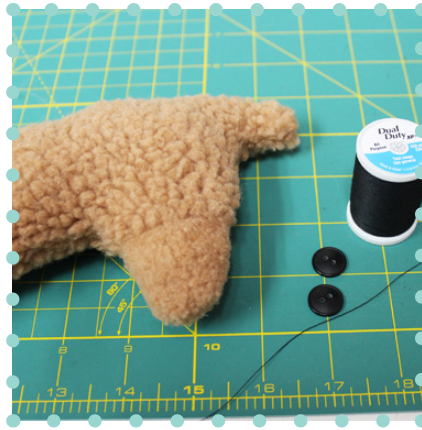
Step 6: Attach black button eyes to either side of the head.