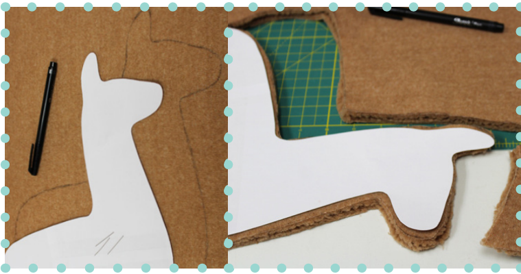
Step 1: Prep and tape together the Llama pattern pieces. Trace and cut out two Llamas from Sherpa Fabric.