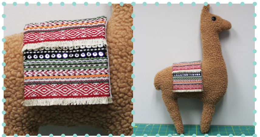
Step 11: Starting from the middle of the saddle, handstitch the finished saddle to your Llama's back.