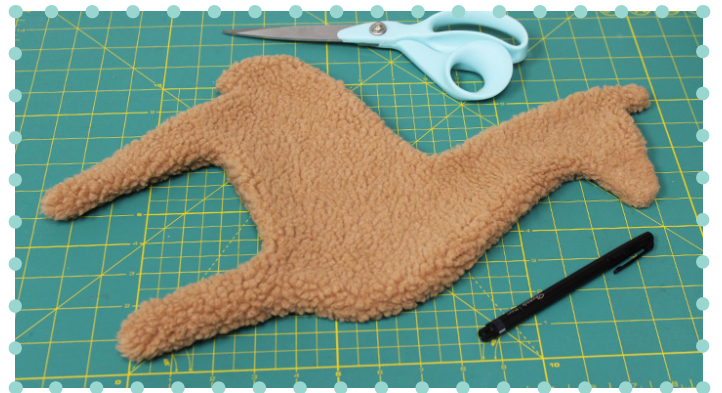
Step 4: Turn inside out. You may use a pencil in the hard to reach areas (ear and nose) to help unfold the fabric and bring everything to point. Stuff the Llama through the stomach, with fabric scraps or stuffing.

*Note: Be sure that the right sides of the fabric are together before sewing.